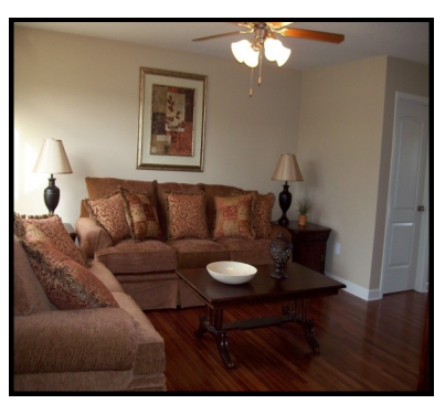
Proudly Marketed By: